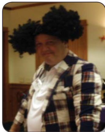
No shortage of laughter at ARPP-26