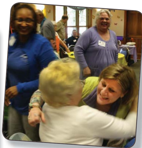
Earning hug joules brought laughter and joy.