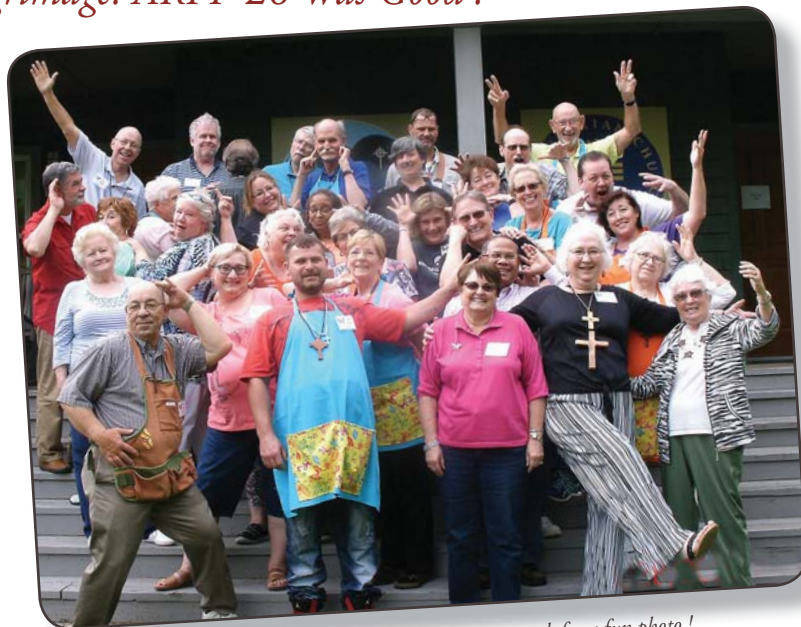
The rain stoped perfectly on time -- just long enough for a fun photo!

Yes, 'It's in God's hands'. Let us thank him and rejoice.