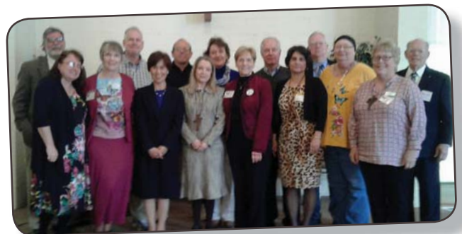
The two Hot Springs area renewal groups work together and are family.