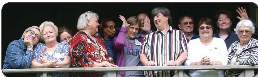
Table groups at ARPP-26 bonded as family